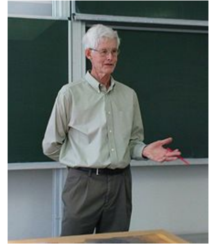
Stephen A. Cook (* 1939)

Thus: if we know that a partial correctness property is valid, then we know that there is a corresponding proof.