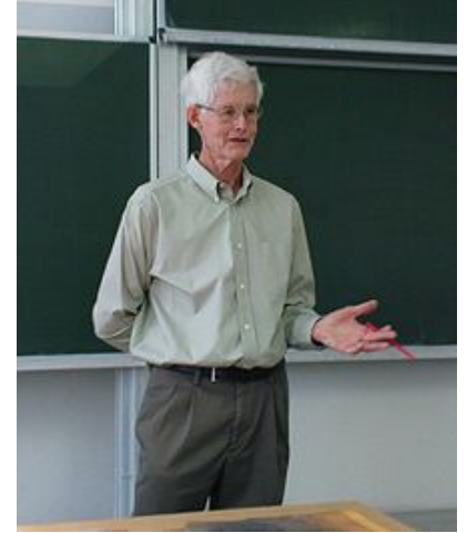
Stephen A. Cook (* 1939)

Thus: if we know that a partial correctness property is valid, then we know that there is a corresponding proof.