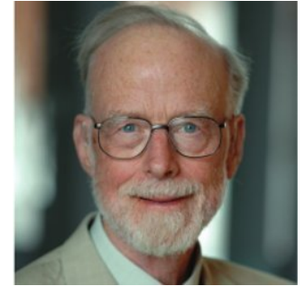
Tony Hoare (* 1934)

Here A[x \mapsto a] denotes the syntactic replacement of every occurrence of x by a in A .