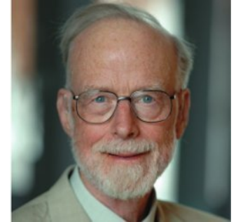
Tony Hoare (* 1934)

Goal: syntactic derivation of valid partial correctness properties. Here A[x \mapsto a] denotes the syntactic replacement of every occurrence of x by a in A .