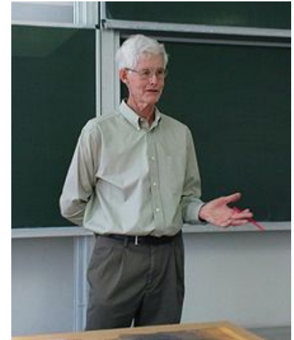
Stephen A. Cook (* 1939)

Thus: if we know that a partial correctness property is valid, then we know that there is a corresponding derivation.