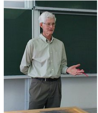
Stephen A. Cook (* 1939)

Thus: if we know that a partial correctness property is valid, then we know that there is a corresponding derivation.